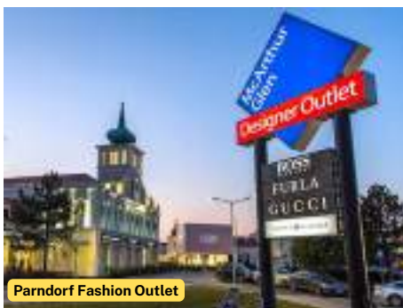
Parndorf Fashion Outlet

Shop at the famous designer outlet with hundred over designer brands offering massive discounts.