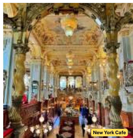
New York Cafe

Free till transfer to airport for departure flight.