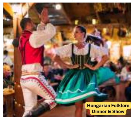
Hungarian Folklore Dinner & Show

End the day with an optional a. Danube River Cruise b. Hungarian Folklore Dinner & Show c. New york cafe