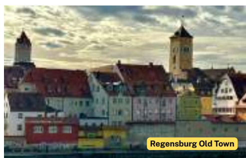
Regensburg Old Town

Regensburg offers a rich tapestry of medieval architecture, vibrant culture, and scenic riverside views. Marvel at the sophisticated St. Peter's Cathedral , Old Stone Bridge and explore the main sights of the Old Town .