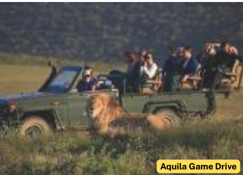
Aquila Game Drive

Set out in an open-top bush vehicles for a guided game drive through the vast park with an opportunity to encounter Big 5 (lion, elephant, buffalo, leopard and rhinoceros) and photograph the abundant wildlife at close range, while your ranger explains the animals' survival tactics in the wilderness.