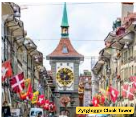
Zytglogge Clock Tower