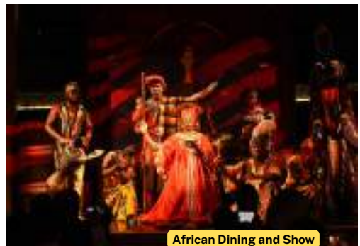
African Dining and Show