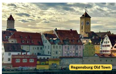
Regensburg Old Town

Regensburg offers a rich tapestry of medieval architecture, vibrant culture, and scenic riverside views. Marvel at the sophisticated St. Peter's Cathedral , Old Stone Bridge and explore the main sights of the Old Town .