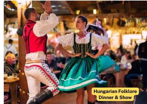
Hungarian Folklore Dinner & Show

End the day with an optional a. Danube River Cruise b. Hungarian Folklore Dinner & Show c. New york cafe