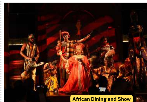
African Dining and Show