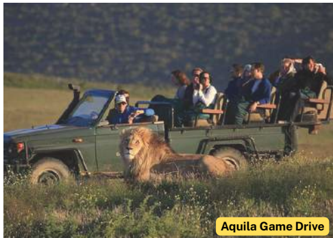
Aquila Game Drive

Set out in an open-top bush vehicles for a guided game drive through the vast park with an opportunity to encounter Big 5 (lion, elephant, buffalo, leopard and rhinoceros) and photograph the abundant wildlife at close range, while your ranger explains the animals' survival tactics in the wilderness.